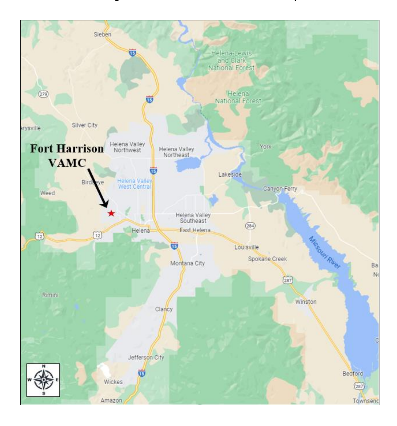
Figure 1: Fort Harrison VAMC Location Map