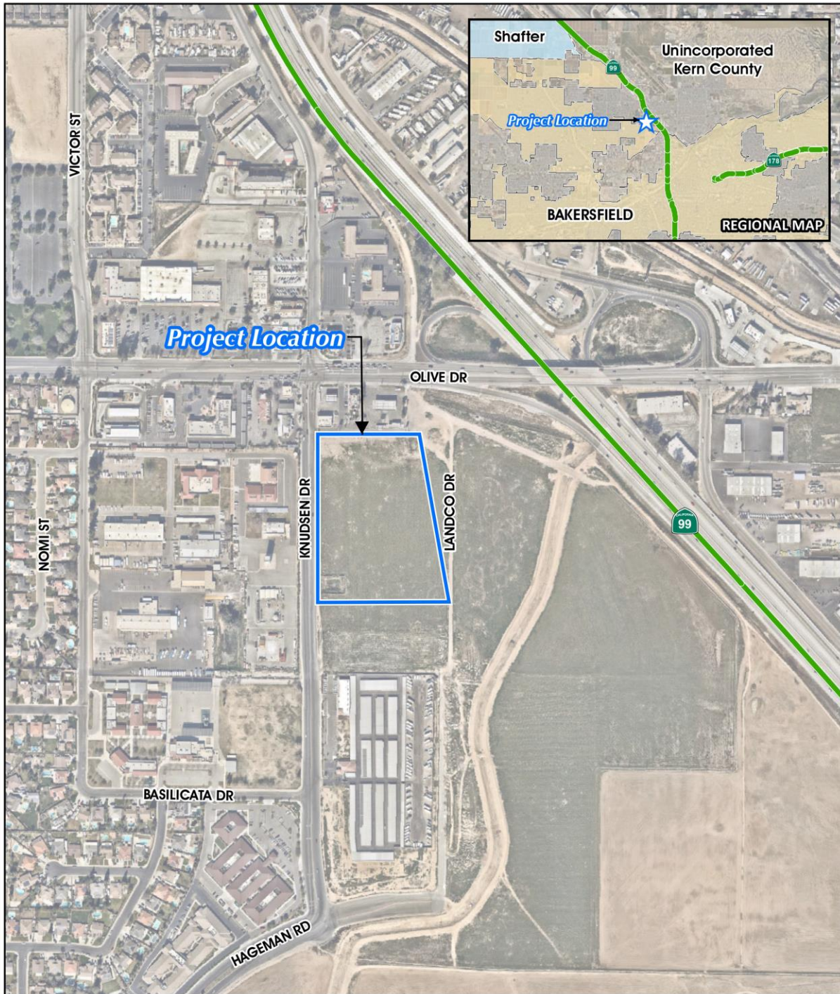
Figure 1. Project Location