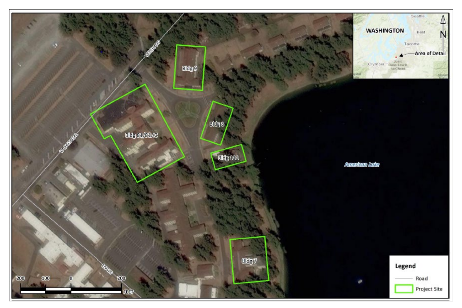
Figure 1. Location of Proposed Building Seismic Upgrades, American Lake Division Campus, Tacoma, WA