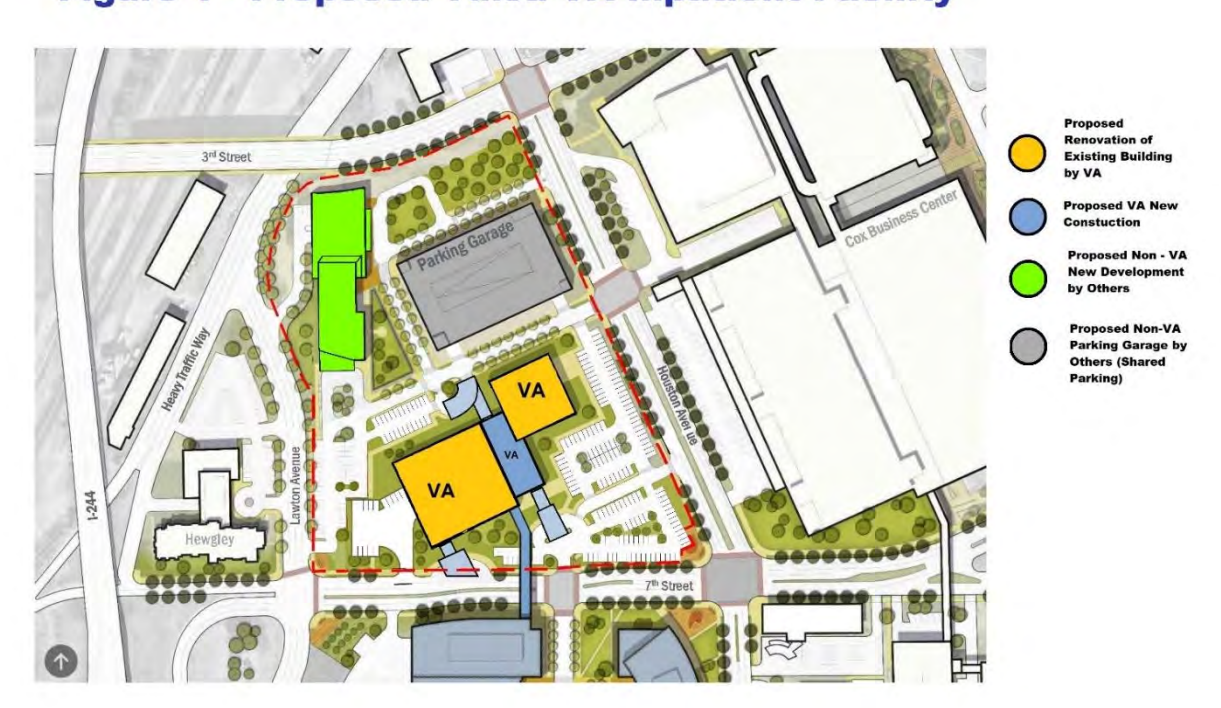
Figure 1 - Proposed Tulsa VA Inpatient Facility

VA anticipates publishing the Draft EA for a 30-day public review and comment period in early 2022. VA will notify stakeholders via email/mail, publish a notice of availability of the Draft EA in the Tulsa World, and solicit comments at that time. The Draft EA will be available for review at the Tulsa City County Public Library, 400 Civic Center, Tulsa OK 74103, and via the VA website: <a href="https://www.cfm.va.gov/environmental/">https://www.cfm.va.gov/environmental/</a>.